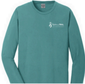
Beach Wash Long Sleeve T