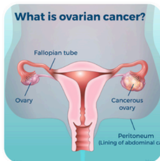
Animated Patient Guide - You and Ovarian Cancer