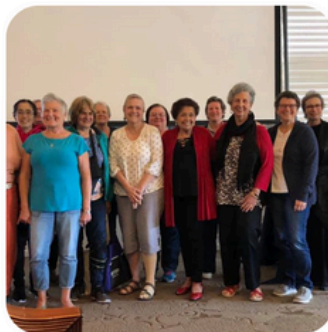
Community Education and Wellness Programs