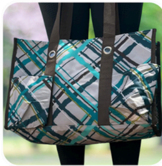
Ovarian Cancer Care Package