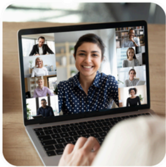
Online Survivor Peer Support Group