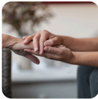
Online Caregiver Peer Support Group