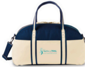
Nantucket Cotton Weekender bag