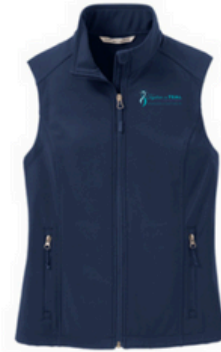
Soft Shell Vest