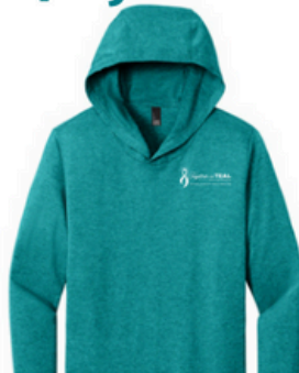
Long Sleeve Hoodie