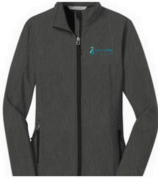
Soft Shell Jacket