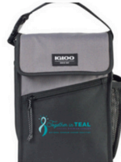
Igloo Lunch Cooler