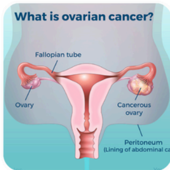
Animated Patient Guide - You and Ovarian Cancer