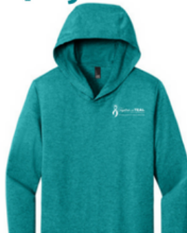
Long Sleeve Hoodie