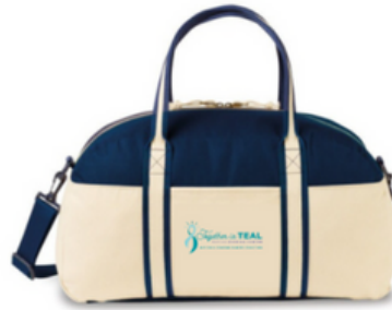
Nantucket Cotton Weekender bag