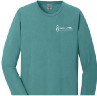
Beach Wash Long Sleeve T