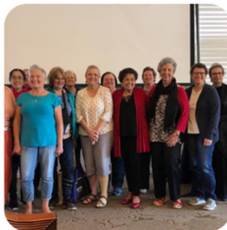
Community Education and Wellness Programs