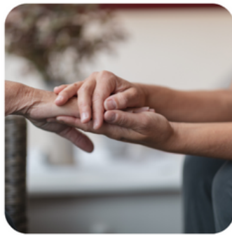
Online Caregiver Peer Support Group