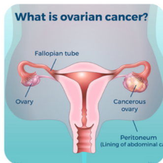
Animated Patient Guide - You and Ovarian Cancer