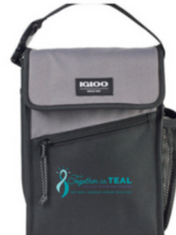
Igloo Lunch Cooler