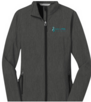
Soft Shell Jacket