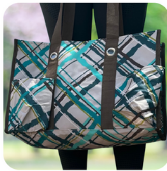
Ovarian Cancer Care Package