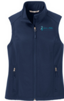
Soft Shell Vest