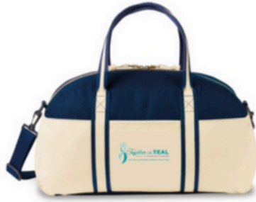
Nantucket Cotton Weekender bag