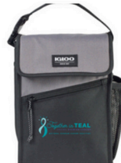
Igloo Lunch Cooler